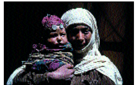
Mother and child in Central Asia.

The causes of visual loss in 1411 children attending schools for the blind in different geographical areas in India are described. Ninety-three percent (1318) of the children were severely visually impaired (SVI) or blind (i.e., corrected acuity in the better eye of <20/200 [<6/60]). In 60% of SVI/blind children vision loss was attributable to factors operating in the prenatal period, in 47% the prenatal factors were known and definite, and in 13% prenatal factors were the most probable causes. Hereditary retinal dystrophies and albinism were seen in 19% of SVI/blind children and 23% had congenital ocular anomalies. There were variations in the relative importance of different causes by state. The observed pattern of causes