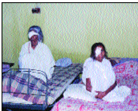
After eye camp cataract surgery in India

The survey methodology and detailed results of the first study have been reported elsewhere. 4,5 In 1995, these rapid assessments were conducted in 19 districts of Karnataka State in the south west of India, covering a total of 21,950 persons, and in 1997 in the predominantly urban district of Ahmedabad in Gujarat, covering 1962 persons. 6 The main indicators collected through these rapid assessments are the prevalence of bilateral and unilateral blindness or (severe) visual impairment due to cataract and the prevalence of bilateral and unilateral aphakia. From these two statistics the Cataract Surgical Coverage (CSC) can be calculated.