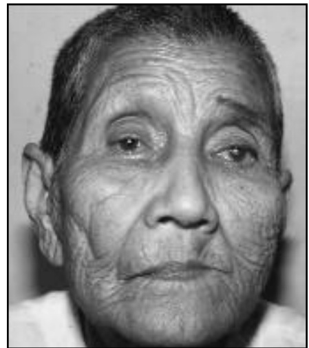
After cataract surgery right eye. Maturing cataract, left eye

An ACIOL should only be inserted after an ICCE if the vitreous face is not protruding and the anterior chamber is deep. It is recommended that an ACIOL should not be inserted if vitreous has been lost or is present in the anterior chamber. It is essential to obtain secure wound closure, with at least 5 interrupted sutures, if an ACIOL is implanted.