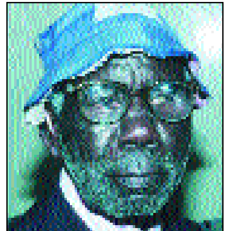
Spectacle aphakic correction for an 'only' eye in Uganda

Cataract stands out as the first priority amongst the major causes of blindness, with an estimated present backlog of 16-20 million unoperated cases. The number of cataract operations/million population/per year is a useful measure of the delivery of eye care in different settings; this demonstrates great differences, as follows: