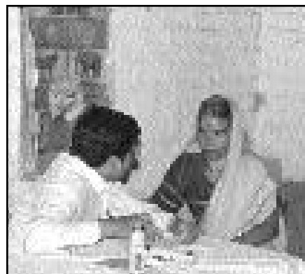
Taking time to listen and answer questions, near Pune, India

Counsellors sit at their desks in the outpatients' department with a model of an eye, specimens of cataract, IOLs, one pair of +10 dioptre spectacles and information materials on common eye diseases printed in the local language. They first go through the doctor's advice in the case record and try to answer the patient's questions accordingly. In developing countries patients usually prefer conventional cataract surgery, which costs less than extracapsular cataract extraction (ECCE) with IOL implantation. Counsellors, in the hospital setting, try to change their ideas by showing them the heavy, cosmetically unacceptable +10 dioptre spectacles, and then telling them of the other advantages of IOL implantation. They also mention that recurrent expenditure to buy aphakic corrections works out costlier than paying for an IOL. They inform the patient about the common minor post-oper-