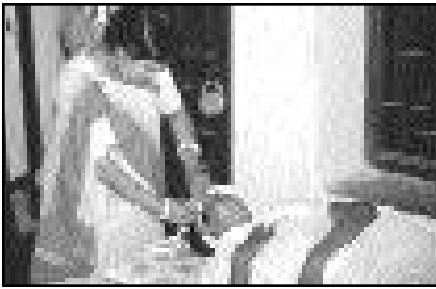
Eye camp surgery in India: post-operative inpatients