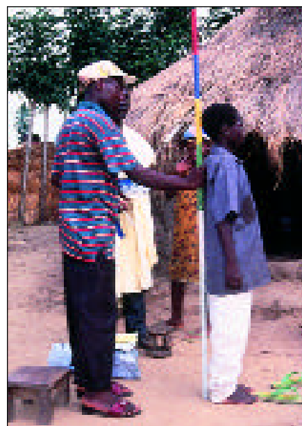
Measuring height before providing the correct dose of ivermectin