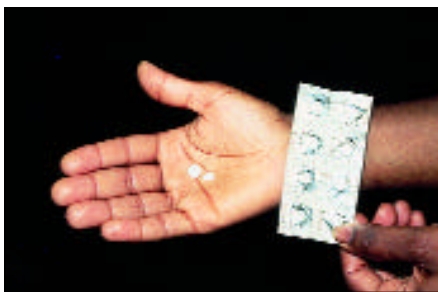
Distribution of ivermectin