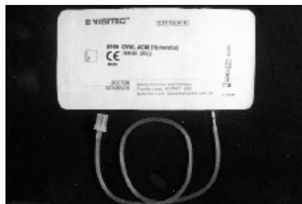
Fig 1: The anterior chamber maintainer (ACM). The metallic end goes into the eye through a paracentesis. The other end is connected to the infusion bottle using an IV line. The packet shows the make and catalogue number.

Good lighting and magnification improves visibility and is required even for ICCE. A good microscope fulfils these two requirements. Wound construction, recognition and management of problems like residual cortex, posterior capsule rupture, vitreous