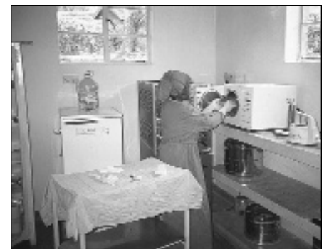
Bench top autoclave in use in Kenya