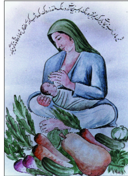
Prevention of Vitamin A deficiency. A poster in Central Asia