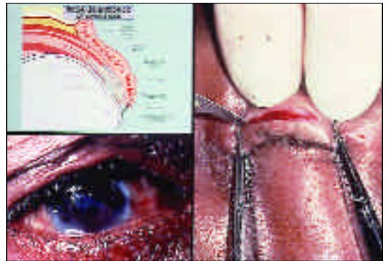
Surgery for upper eyelid trichiasis