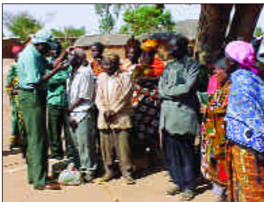
Trichiasis screening with the aid of a magnifying loupe in rural central Tanzania