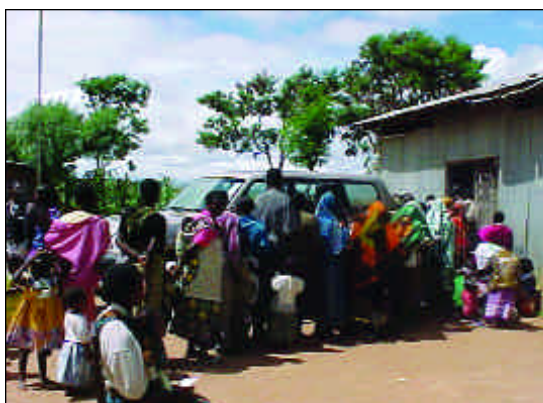
An outreach eye clinic in central Tanzania