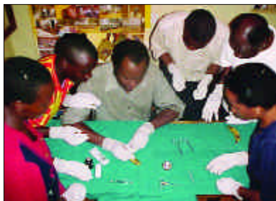
Bilamellar tarsal rotation procedure (BTRP) training in session

With sterile instruments and other supplies at hand, the procedure should be done following these steps: