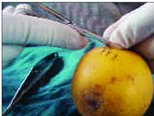
Stitching exercises on an orange