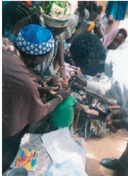
A young child receiving azithromycin. MALI