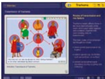
Example from the Wellcome Trust Trachoma CD-ROM 2nd Edition

Fax: +44 (0) 20 7611 8270. Please mark the fax TRACHOMA 2nd Ed CD-ROM.