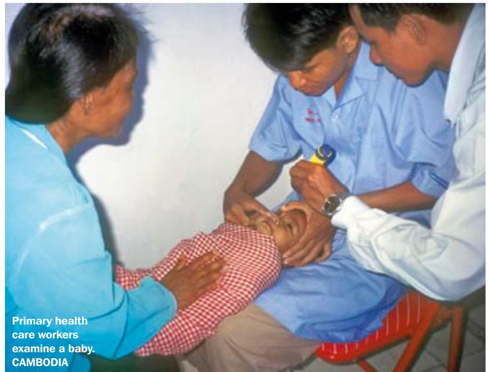
Primary health care workers examine a baby. CAMBODIA