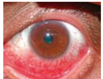
Fig. 7. Drug induced allergic conjunctivitis

Note the marked conjunctival hyperaemia, Trantas' dots and invasion of cornea by thickened gelatinous pannus.