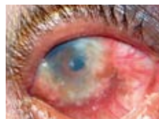
Fig. 2. Right eye of patient in figure 1

Note the dilated, injected conjunctival vessels, Trantas' dots, and corneal scarring and vascularisation. The white tissue in the nasal portion of the pupil is posterior capsule opacification, following cataract surgery.