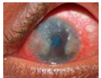
Fig. 6. Child with severe limbal VKC

Note the needle is parallel to the superior tarsal border – entering from the temporal side.