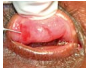
Fig. 5. Technique of supratarsal injection

Allergic reaction in the conjunctiva can be provoked by a drug or its preservative. Common drugs include neomycin and gentamicin. These are common in postoperative drops. When examined, the conjunctiva and the lower eyelids will be swollen. The skin may be excoriated. The first measure in the management is to stop using the allergen. Topical steroids may also be used to relieve the symptoms. Far too often the offending drug has been given for a minor symptom because the patient expects drops. This often does more harm than good (Figure 7).