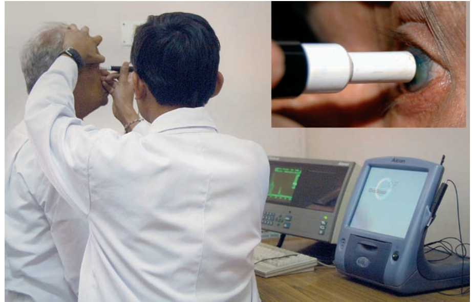
Figure 1. Photograph showing technique for applanation A-scan biometry

The measurement of axial length measurement has the greatest potential for error in calculating IOL power. Traditionally, contact A-scan ultrasonography is used. This