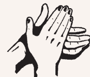
Rub palm to palm