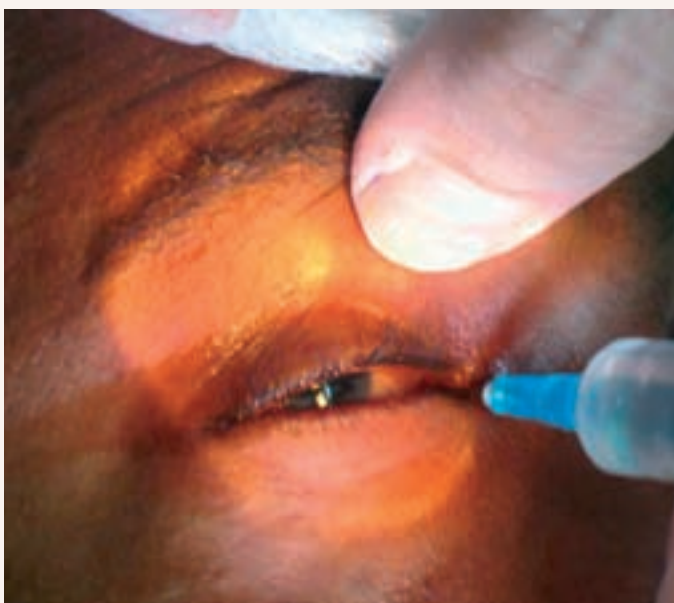
Figure 4. Peribulbar block: the needle is advanced between the caruncle and the medial canthus in a backwards and medial direction, away from the globe.