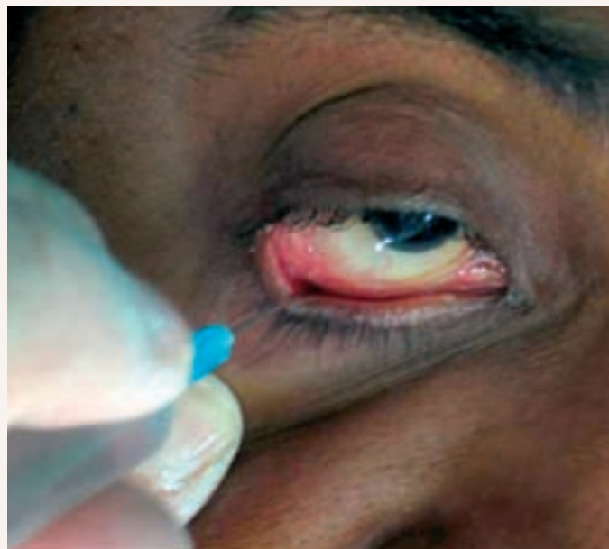
Figure 3. Peribulbar block: the needle is inserted through the fornix below the lateral limbus after the lower fornix was exposed (by pulling the lower lid down gently).