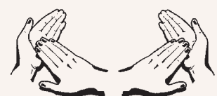
Rub palm of left hand with fingers of right hand and vice versa