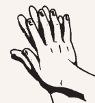
Rub palm to palm with fingers interlaced