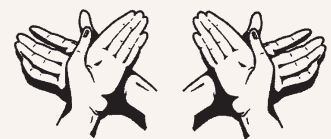
Rub back of left hand over right palm and vice versa