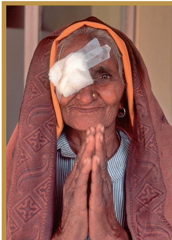
The decision, in 1992, to locally produce high-quality IOLs and the introduction of manual SICS techniques in 1998 have contributed to much greater satisfaction amongst patients, both paying and non-paying