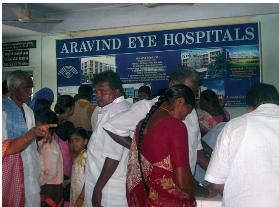
The Aravind Eye Hospital in Madurai. INDIA