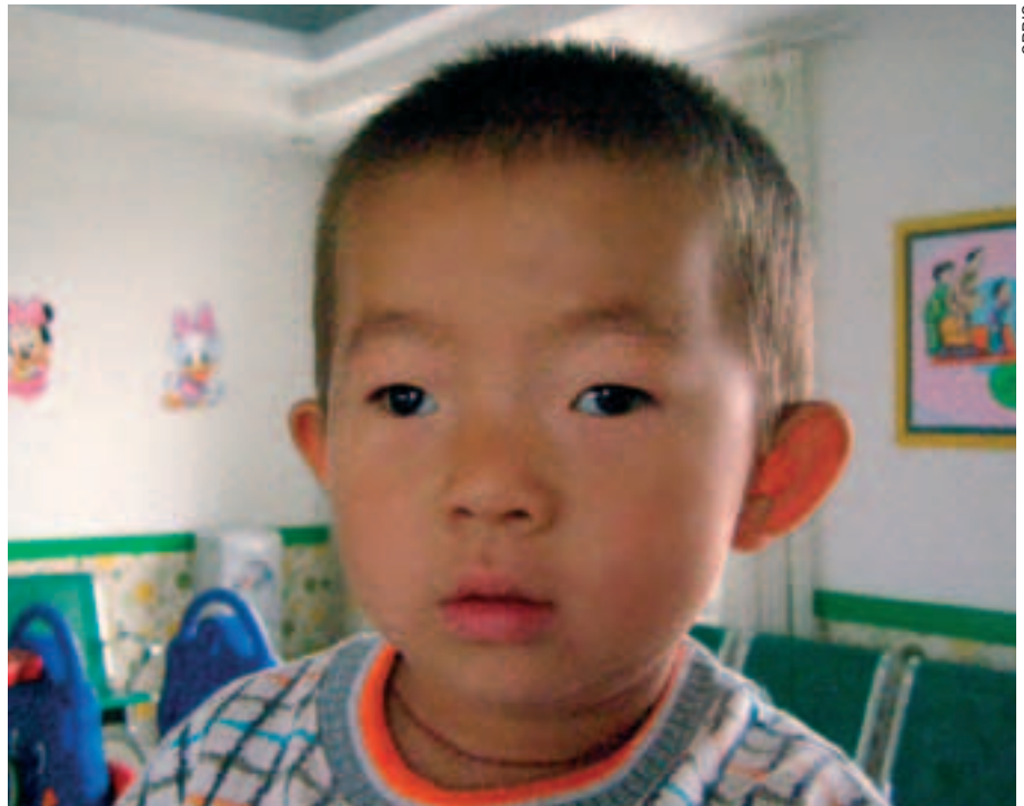
Figure 2. This boy's right eye is deviated outwards, an example of exotropia