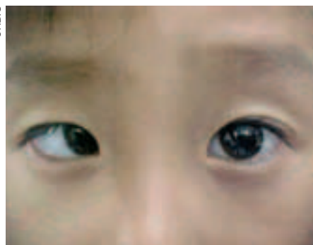
Figure 1. This boy's right eye is deviated inwards, an example of esotropia

Misalignment of the eyes is called strabismus (or squint ). Misalignment means that the eyes are not lined up to look at the same thing. In every case of strabismus or misalignment, one eye is fixed on what the person intends to look at (the fixing eye) and the other eye is looking at something else (the deviated eye).