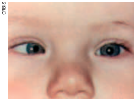
Figure 5. Esotropia in the right eye. The light reflex is central in the left eye (the non-deviated eye), but over the iris in the right eye (the deviated eye).

The person who has strabismus will have the reflection in the centre of the pupil of only one eye (the fixing eye) and the other reflection will be seen over the iris or definitely away from the centre of the pupil (the deviated eye). See Figures 5 and 6.