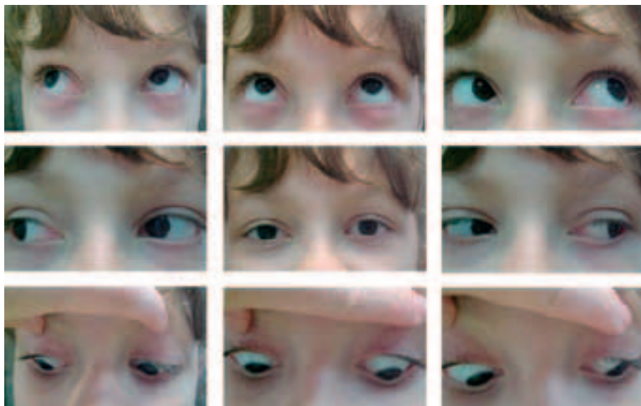
Figure 7. This patient demonstrates the full range of movement of the eyes while maintaining alignment (straight eyes)

Another way to check for strabismus is to cover the fixing eye – the eye that appears to be looking at the target. This will cause the deviating eye (which is not covered) to move in order to look at, or take up fixation, on the target.