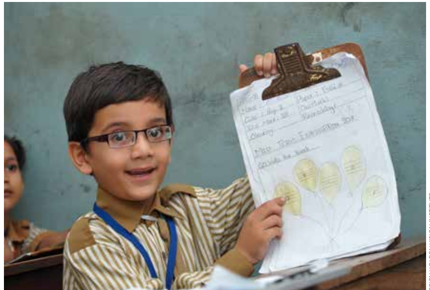
A child after vision correction as part of a school eye health programme. PAKISTAN

Given the paucity of human resources for eye health, especially in developing countries, innovative approaches need to be developed and primary eye care components strengthened.