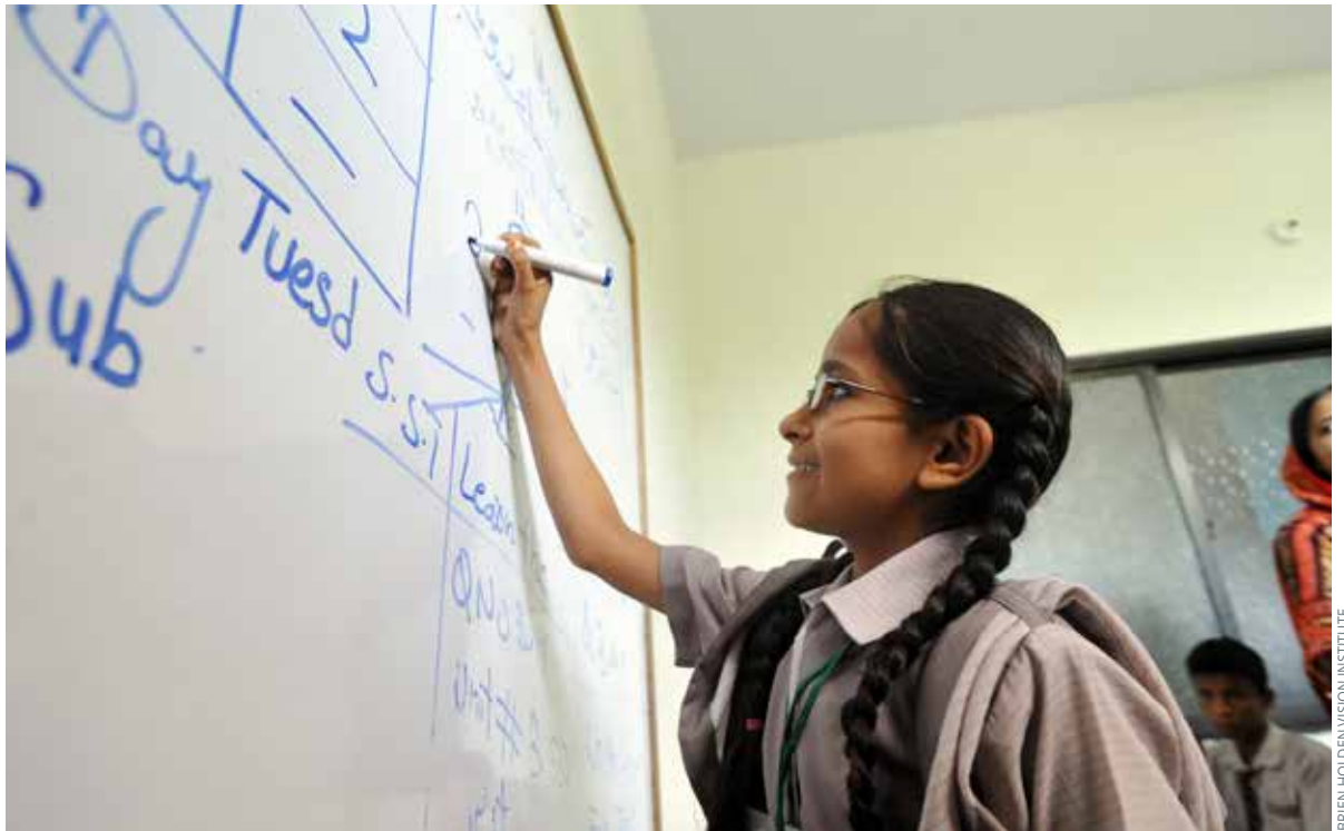
Provision of good quality eye care enhances the confidence of children, especially girls. PAKISTAN