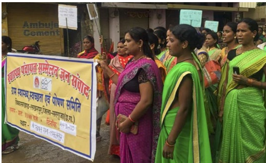
ASHA workers rally to inform village residents and committee members about the time and location of their village health, sanitation and nutrition committee meeting (see panel on page 15). INDIA

Community-based monitoring of health services can put people back in control of their health and the health services they need.