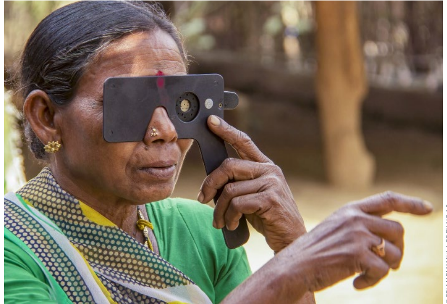
A patient responding to a vision chart. INDIA

Community engagement is vital for the successful implementation of health interventions at a place where people need services. With this in mind, LV Prasad Eye Institute (LVPEI) developed a pyramidal eye care model which has vision guardians as its foundation (Figure 1).