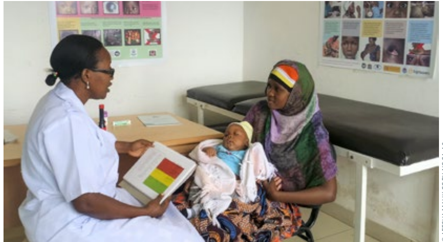
Believe parents when they say there is something wrong with their child's eyes. TANZANIA

Believe parents and caregivers when they say there is something wrong with their child's eye(s) or vision. As some conditions are blinding if not diagnosed and managed promptly, refer the child if you are in any doubt.