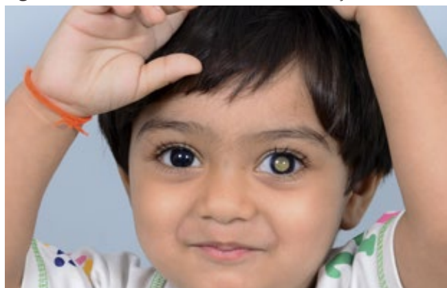
Figure 4 A child with retinoblastoma in the left eye. INDIA