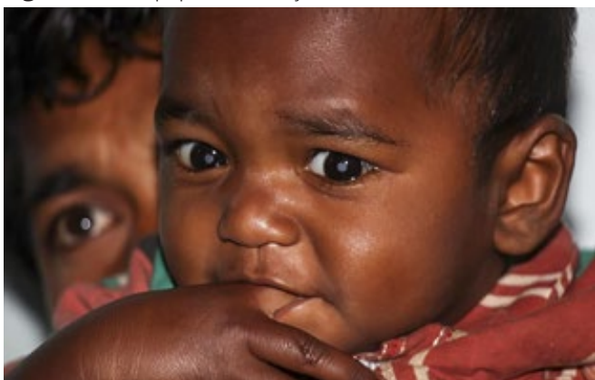
Figure 3 White pupils in both eyes, due to cataract. INDIA