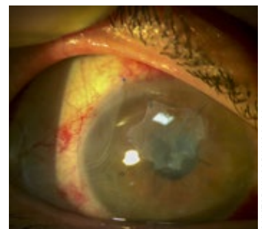
Figure 2 Amniotic membranes in place over the ulcer. UK

If available, amniotic membrane contact lenses can also be used as an alternative to sutured amniotic membrane. These are relatively quick to insert but provide only a single layer of amniotic membrane and tend to be expensive.