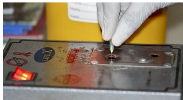
Figure 4 An electrically powered needle destroyer, Nepal

If incineration is not available, a full sharps plastic container can be filled with plaster of Paris, or something similar, to encase the sharps waste within the container, creating a solid mass that can be disposed of safely or buried. Automated machines which destroy needles by burning or cutting them can be used to render needles unusable and prevent needlestick injury (Figure 4).