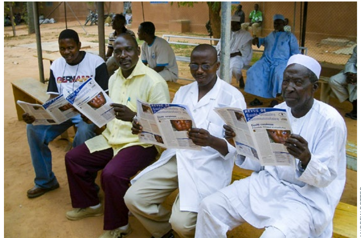
Taking time to read the Community Eye Health Journal . NIGER

Thirty years and 100 issues call for celebration and reflection. In this article, the editors and the journal team do both, while the current editor considers the impact the Community Eye Health Journal has on its readers and the patients they serve.