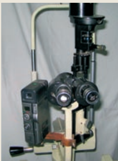
Slit lamp video system, as seen from the examiner's side. The forehead rest band has been removed to show the essential structures more clearly

The camcorder is shifted in the centre and the focusing rod provided with the slit lamp is inserted in place. The manual focus mode is set and the slit beam is turned on. Fine adjustments are made to bring the slit beam image in the centre of the viewfinder, and the screws are tightened in this position. Next, the fine focusing is done and the rod is removed. A source for diffuse light (Canon video camcorder flash) is attached beside the reflection mirror of the slit beam for background illumination. (Any diffuse light source can be used). The video-out lead is attached to an ordinary colour television. (The video-out lead can also be attached to a video capture card in a personal computer).