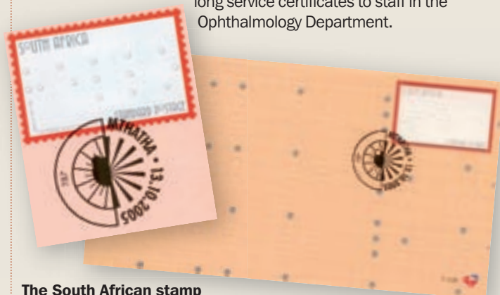
The South African stamp includes the word 'hello' in Braille