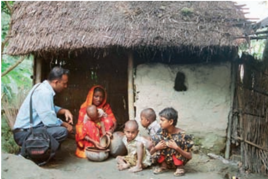
Key informants motivate parents to bring their children for eye examinations by the mobile eye care team. BANGLADESH

of up to 20. The sessions last half a day and key informants are taught how to find blind children in their local community. Training includes an explanation of blindness and its causes in children; emphasis of the fact that many blind children can benefit from treatment, education, and other services; and assessment of vision. 'Counting fingers' at three metres is used for children aged 6 to 15. In order to ensure that pre-school children are not missed, key informants are trained to refer a child for examination if the mother thinks there is an eye or vision problem. The key informants are also encouraged to network over the following three to four weeks in order to identify children thought to be blind or to have 'serious visual problems'. They may work in pairs or small groups to encourage and support each other.