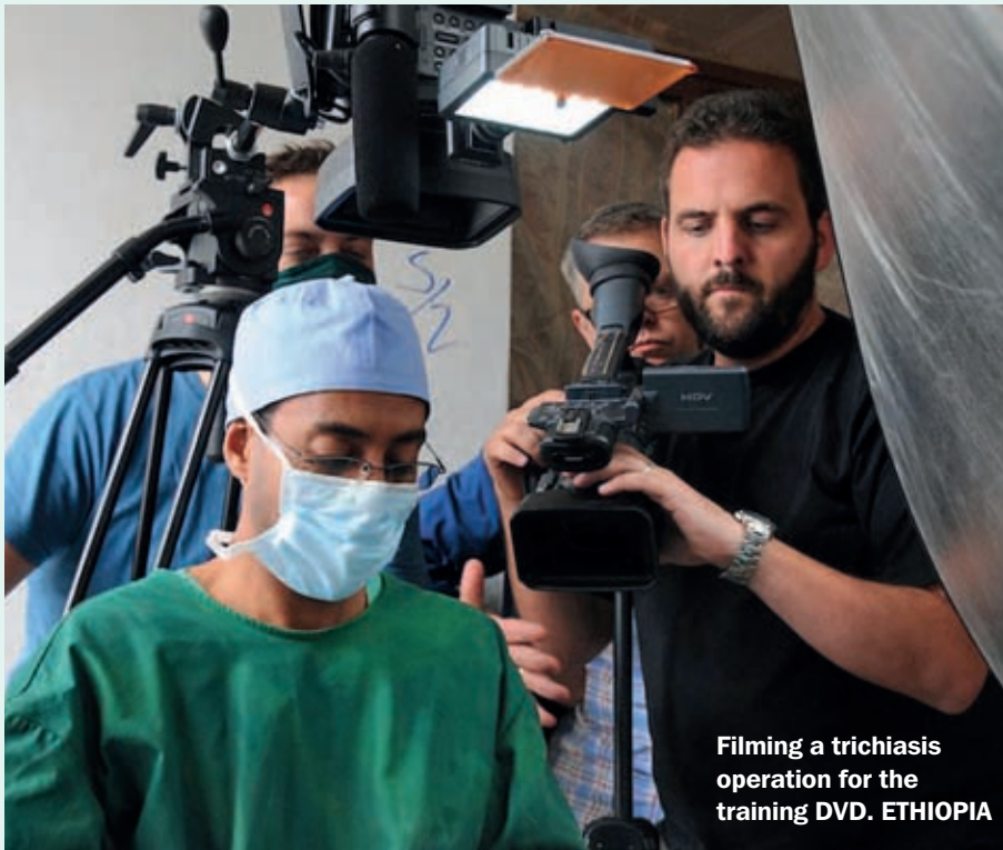
Filming a trichiasis operation for the training DVD. ETHIOPIA