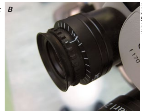
Preparing for surgery also includes the small details. If the microscope is not set up correctly (A), it will compromise the surgeon's view during the procedure. B shows the correct setup.